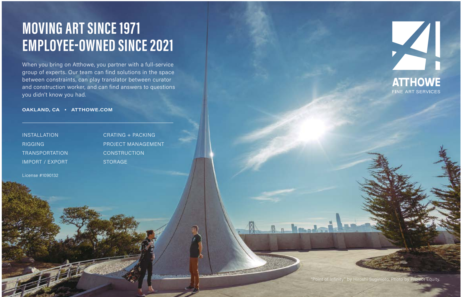
"Point of Infinity" by Hiroshi Sugimoto.