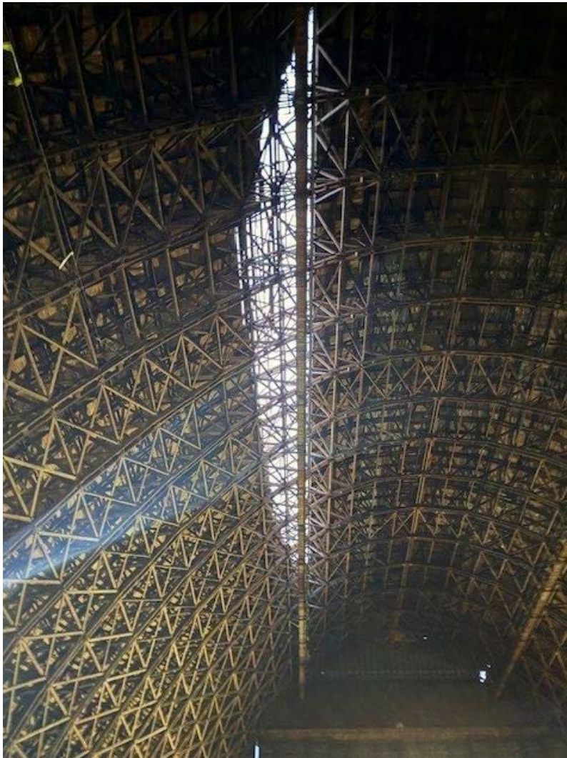
Interior view of the damaged roof, approximately 160 to 180 feet in length and up to 30 feet wide.

the SAVE Hangar B campaign to raise awareness and funds necessary to stabilize and restore the structure.