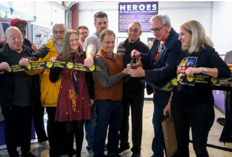
Ceremonial ribbon cutting at the opening of Northwest Museum of Cartoon Arts, November 3, 2025.